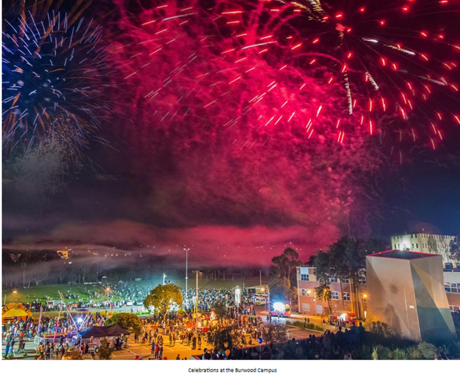
Celebrations at the Burwood Campus