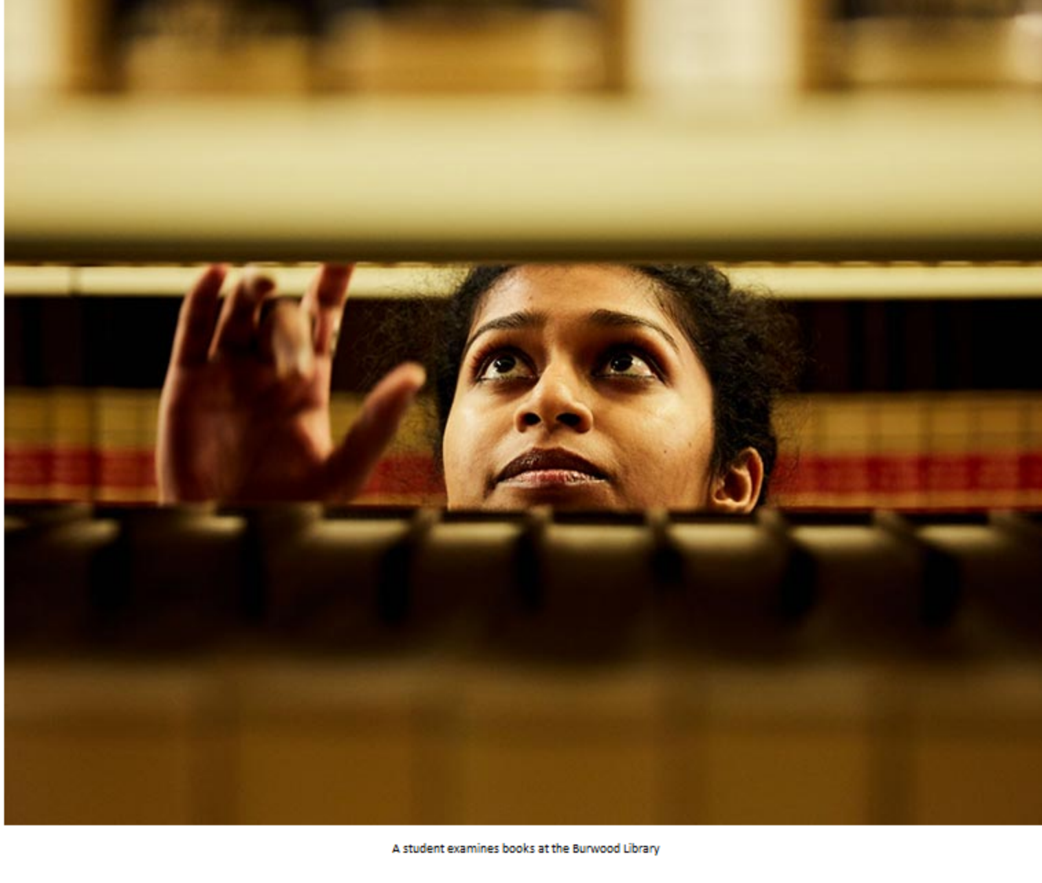
A student examines books at the Burwood Library